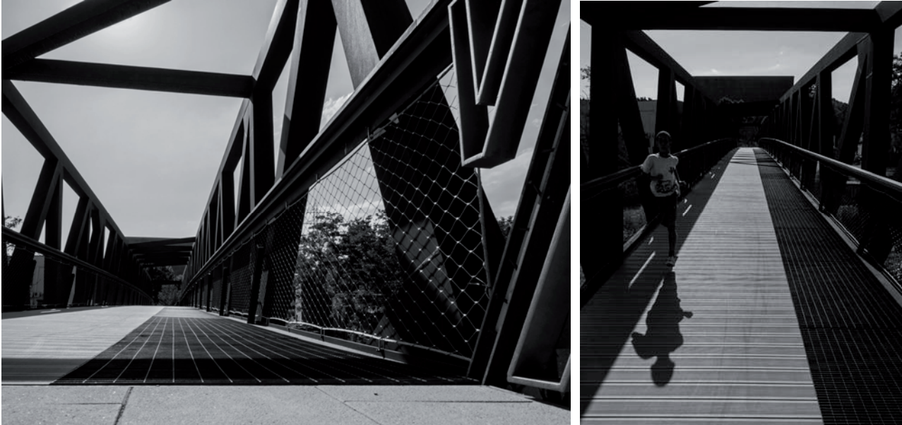
Fig. 3 and 4. Inner views of the deck

scheme. As a result, we provided pedestrians and cyclists a special user experience with a highly effective and very low maintenance structure, which, along with a careful selection of the rest of materials, allowed us to achieve the sought goals with a highly cost-effective solution.