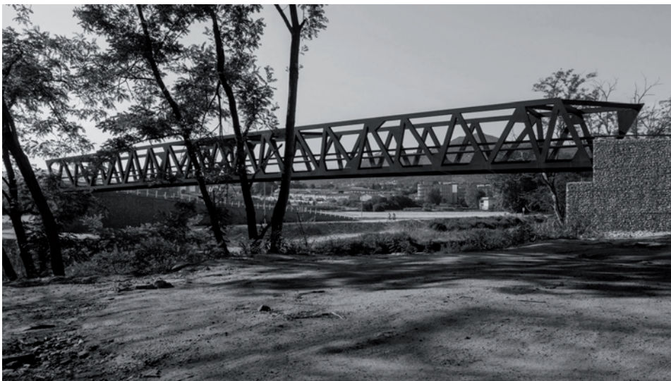
Fig. 1. General view of the footbridge